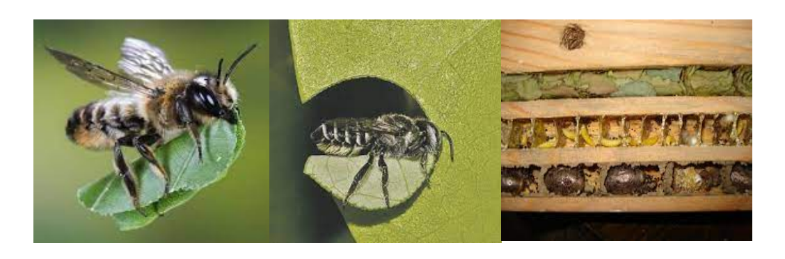
Leaf Cutter Bee (Megachile)