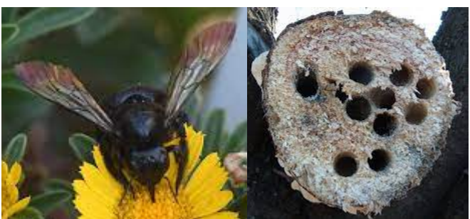
Valley Carpenter Bee (Xylocopa sonorina)