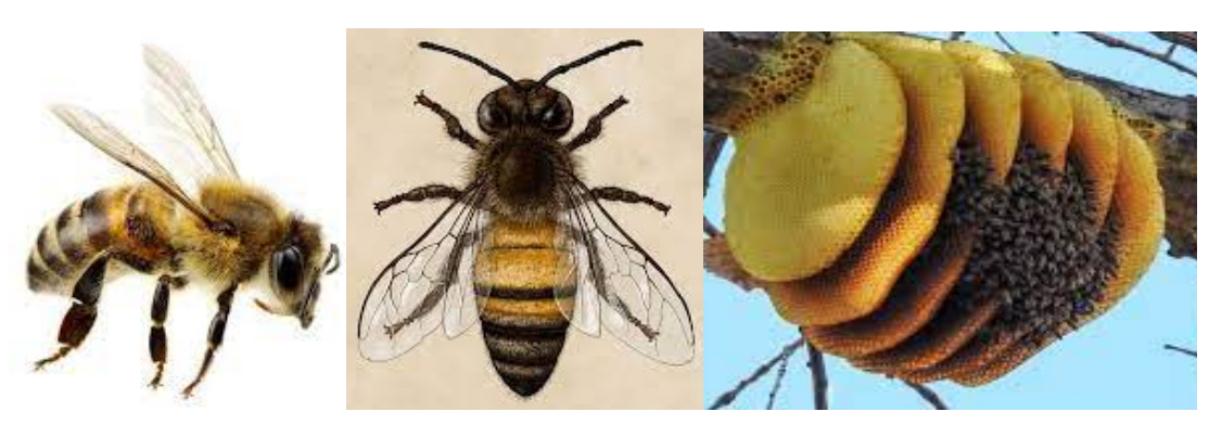
Honey Bee (Apis mellifera) Tree Nester