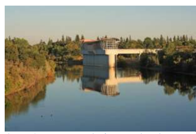
Figure 1: Sacramento water intake on American River.

the south. The American River is not only an important recreational attraction for the Sacramento region, it is also a primary source of our drinking water . Water is drawn out of the river just upstream from the Sac State campus, where it is treated and sent into the city's distribution system (see Figure 1). About 100 million gallons is supplied to the city every day, half of which comes from the American River (SDU 2016). The next time you see the American River, think about your drinking water; and the next time you turn on the tap, think of the American River!