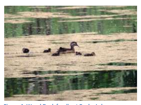
Figure 4: Wood Duck family at Bushy Lake.

When we experience how precious and refreshing water can be – whether cooling off at Raging Waters or in the American River – we should also be reminded that other species also share the urban environment and need water, too. Bushy Lake is very important for this reason, serving as a water source and a