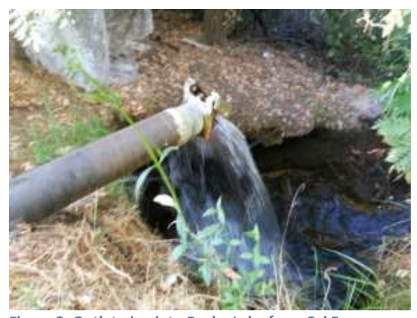
Figure 3: Outlet pipe into Bushy Lake from Cal Expo.

Since Folsom dam was built in the middle of the last century, water releases to the lower American River have been controlled to protect Sacramento residents from flooding, which used to happen more regularly (Castaneda and Simpson, 2013). As a consequence, water levels no longer rise high enough to fill the historic floodplain. Still, Bushy Lake retains many riparian characteristics (see other flyers) that demonstrate its ongoing relationship with the American River.