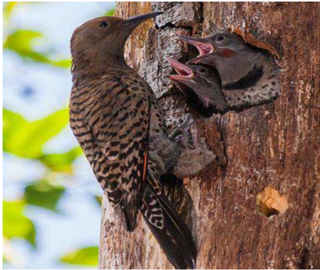
Figure 4: A Northern Flicker feeding young in a cavity nest www.paws.org/wildlife/having-a-wildlife-problem/birds/woodpeckers/

Woodpeckers are cavity nesters that make their homes in the trunks and limbs of dead trees due to the hard outer shell of the bark and soft interior (Cornell, 2002).