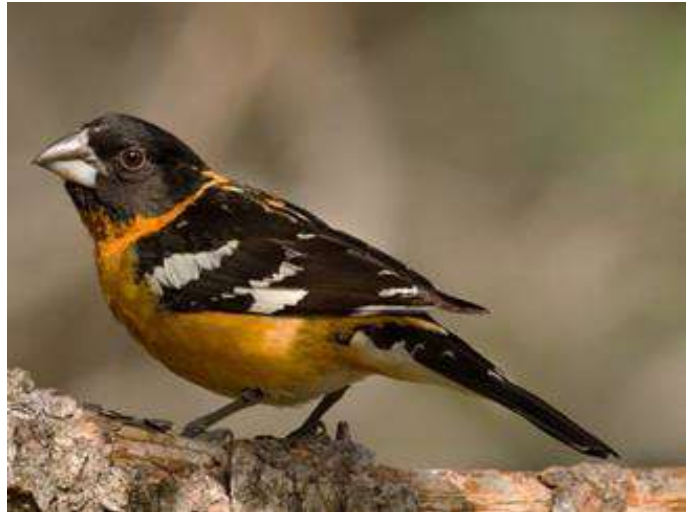
Figure 7: Male Black-headed Grosbeak Poudre Canyon, Fort Collins, Colorado, June 2010

Black-headed Grosbeaks prefer varied habitats of thick understory and tall trees. Their diet consists of insects, seeds and berries. They favor sites in close proximity to water and build their nests in shrubs or small trees (Cornell 2015.)