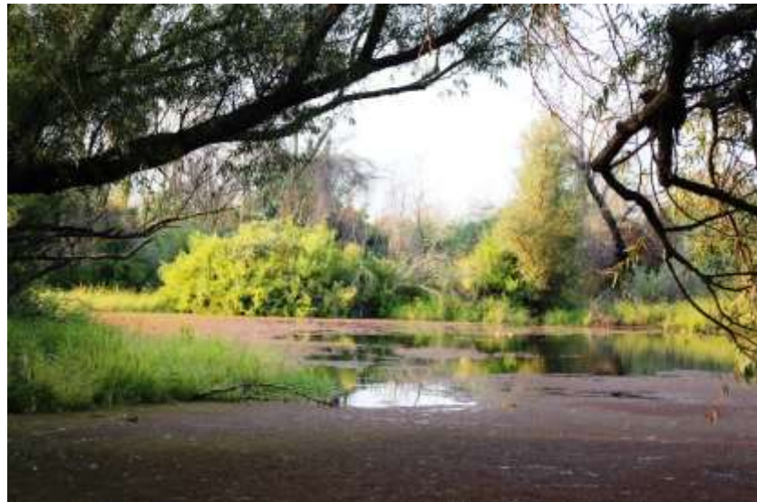
Figure 2: Bushy Lake, Spring 2015

On July 4, 2014, a fire burned 160 acres of the ARP near Bushy Lake that inspired a collaborative restoration project with scientists from Sacramento County Parks Department; California State University, Sacramento (CSUS); ARP Foundation, University of California, Davis (UC Davis); and Yale University (Stevens 2014). Birds are more easily observed than other wildlife and respond quickly to changes in their environment; therefore, they are ideal candidates to measure ecosystem health and improvement during the Bushy Lake restoration project and post-restoration monitoring.