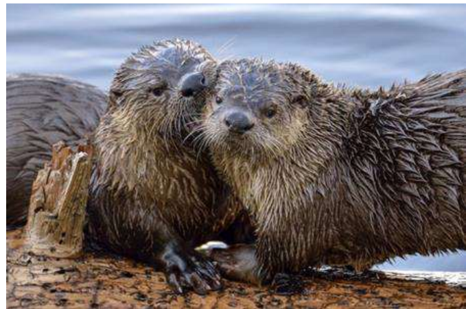
Figure 12: River Otters http://animals.nationalgeographic.com/animals/mammals/american-river-otter/

North American River Otters ( Lontra Canadensis ) are a keystone carnivore and another Bushy Lake resident that requires a permanent water source; however, there is little information about their status and range in California. Unlike the Western Pond Turtle, River Otters are able to travel large distances in search of food, mates, or a more suitable living area (Bouly et al. 2015). A pair of otters was observed on morning defending their territory from human observers, making nasal barking noises at us from the water's edge.