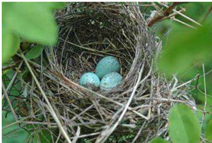
Figure 8: Black-headed Grosbeak nest