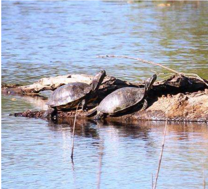
Figure 11: Western Pond Turtles at Bushy Lake photo: Michelle Stevens, May 2016

The Western Pond Turtle ( Actinemys marmorata ) relies on a permanent water source with floating woody vegetation and muddy banks for basking. The Western Pond Turtle has suffered a 99% decline in some areas and is listed as a species of special concern in California. Although this species is not yet recognized as federally endangered in California, its status is currently under review (Center for Biological Diversity 2015). If Bushy Lake is allowed to dry up, the nearly 800-yard distance to the American River might be too far for these turtles to remain in this area. We observed over 20 western pond turtles one early spring day, basking on logs in the tranquil waters of Bushy Lake. Females were observed making their way to the grassland to lay their eggs.