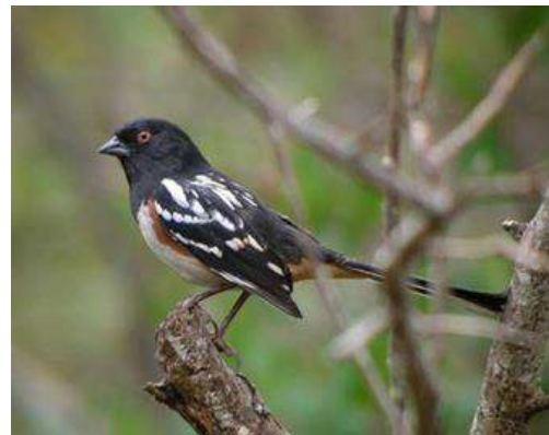
Figure 5: Male Spotted Towhee © Jamie Chavez, Santa Barbara County, CA, September 2007