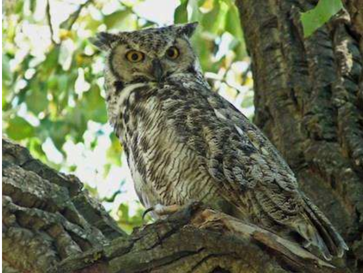
Figure 1: Great Horned Owl © Anne Elliot, Calgary, Alberta, Canada, September 2009

Department of Environmental Studies California State University, Sacramento