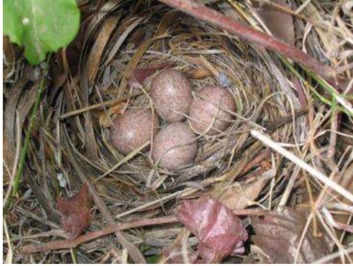
Figure 6: Spotted Towhee nest

delivering their harsh buzzing calls from thick shrubs. They build their nests hidden in shrubs close to the ground or on the ground itself (Bartos et al. 2015).