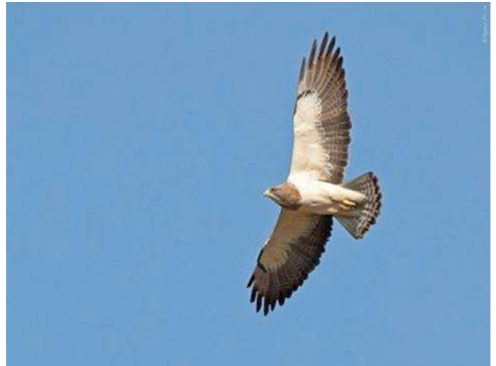
Figure 9: Swainson's Hawk © Raymond Lee, Edmonton, Alberta, Canada, May 2010

Swainson's Hawk is common to the area and is listed under the California Endangered Species Act as level S3 vulnerable due to their restricted range and habitat loss (CNDDDB 2015). They prefer open grassland, much of which has been converted to agriculture. These hawks migrate thousands of miles between wintering lands in Argentina to nesting habitat in grasslands of the United States (Cornell 2015). Bushy Lake meets habitat requirements for nesting due to its tall Cottonwoods and close proximity to nearby grasslands. These hawks are most easily recognized in flight by their bi-colored wings or their shrill "krreee!" call.